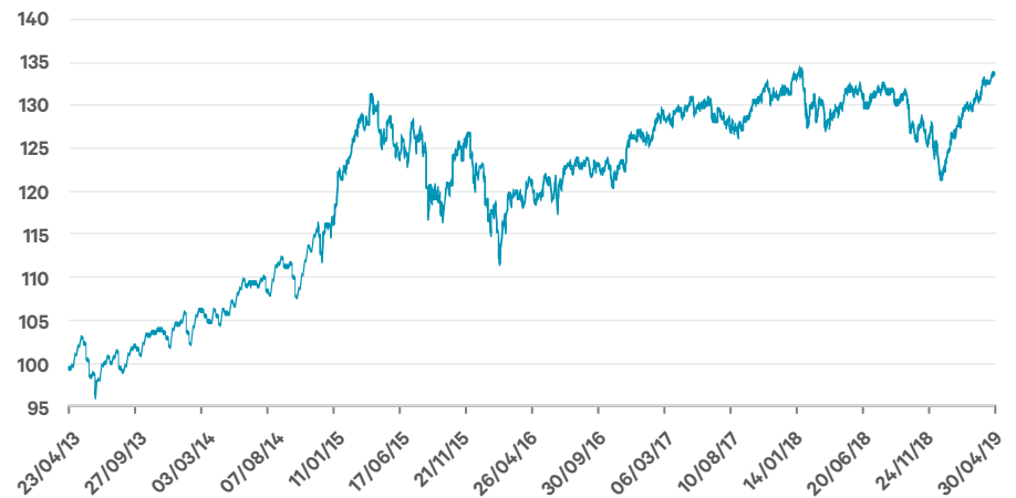
Figure 1: Performance of Davy Balanced Growth Fund at 30th April 2019 6

WARNING: Past performance is not a reliable guide to future performance. The value of your investment may go down as well as up. This product may be affected by changes in currency exchange rates.