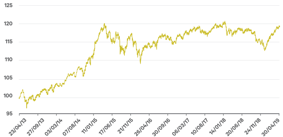
Figure 1: Performance of Davy Cautious Growth Fund at 30th April 2019 6

WARNING: Past performance is not a reliable guide to future performance. The value of your investment may go down as well as up. This product may be affected by changes in currency exchange rates.